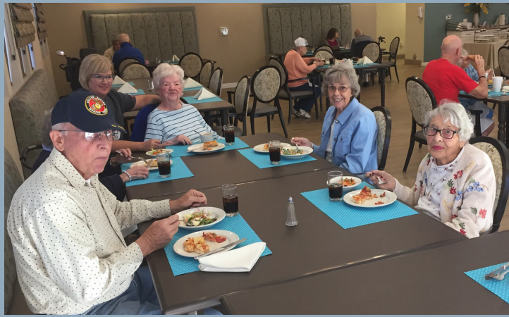
Pizza and salad buffet in the Dining Room? Count us in!