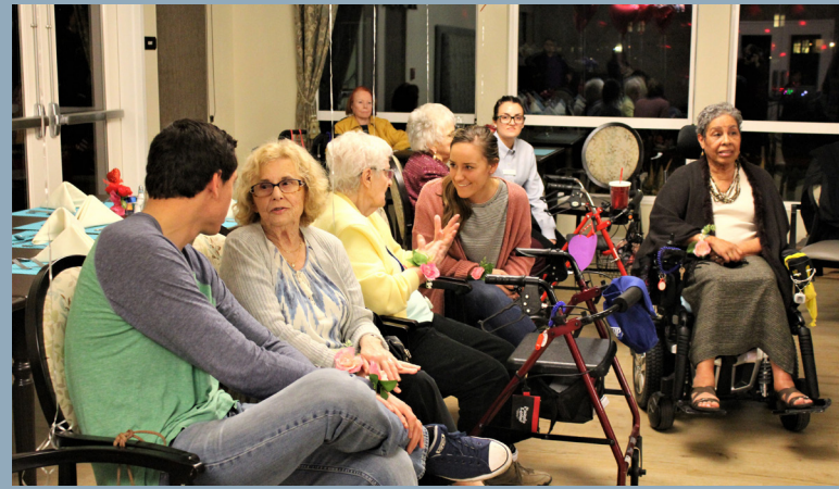
Thank you to Faith Bible Church for attending From Paris With Love.