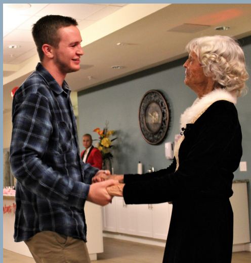
Dot dancing with a man from Faith Bible Church.